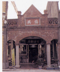
協興的清水磚牌樓立面。 Façade of the arcade of Sie-sing made of red bricks

這坎店為「兩落一過水」格局，是少數未曾易主的店屋。現任屋主的祖父，曾在建成商行擔任管家，後來在大溪頭寮租坑開採煤礦，並在台北開設「協興商行」，從事焦炭販售，現有店號「協興」就是為紀念其祖父而有的。之前則是以店號「恆產」，作為家族經營建材及煤炭事業的事務所。1967年由屋主改作為藥局。此外，店口一角有「李媽媽拼布小藝館」的作品及傳統農產品醃漬醬物的展售。