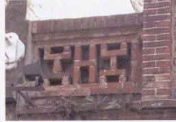
紅磚疊砌構成的趣味「喜」字。 Chinese character "喜" (Si) formed by the laying and piling of red bricks