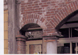
牌樓面間柱的磚圓拱及磚疊澀柱頭。 The pillar capital built of layers of bricks with each layer projecting from the previous layer and the brick circular arch