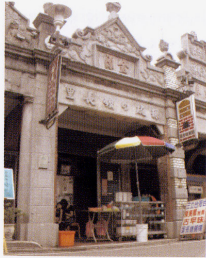
金源的牌樓立面。 Façade of the arcade of Jin-yuan