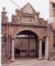
隆泰的牌樓立面。 Façade of the arcade of Long-tai

這坎店由蕭家買下居住已歷經 3 代，店口作過雜貨、布行等生意，目前為代書事務所。原本的規模為「四落三過水」，由於「四落起」的店屋居住人口較多，房間數亦多，位在二落大廳後的房間是由當家夫婦所居住，所以可以從房間居住者的改變，得知其家庭結構的變化。頭落店口現作為辦公室，其他則仍為住家空間。