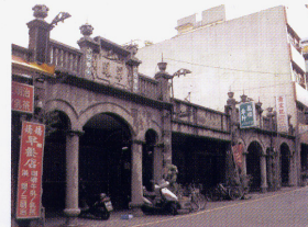
「永安居」赤龍、翠鳳牌樓面的街景。 Street scenes with the façades of the arcades of Chih-long and Cuei-feng

This three-kan store/house has much similarity with a courtyard house; for example, the middle luo is like a courtyard house in the shape of 口. Furthermore, guoshuei on both sides of the pair of side store are similar to a pair of hulung. Consequently, you will have a delusion of standing inside a traditional courtyard house when you walk into the patio from the store and see the main hall.