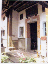
永安居深井內的大廳入口。 Main Hall in the shenjing of Yong-an-ju

這三坎店有許多類似合院的地方，如「中落」像是口字型的三合院，兩側「雙邊間」的「過水」就像左右護龍，所以從店口進入深井看到大廳時，會有身處在傳統合院的錯覺感。